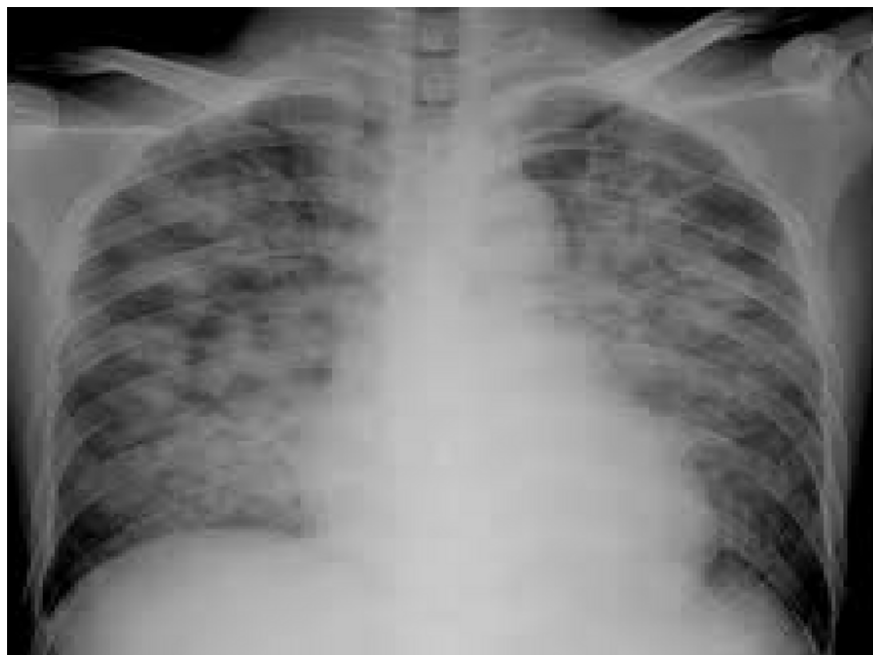
Figure 1. Chest X-ray in AP view demonstrated diffuse bilateral infiltration, both in upper and lower lobes, without any evidence of pleural effusion.