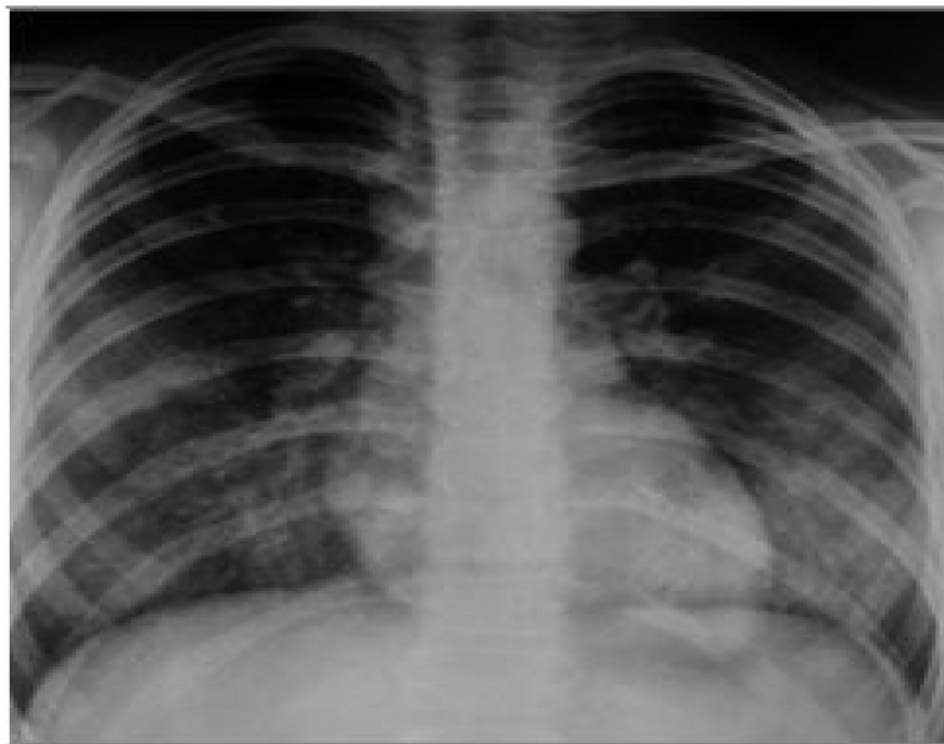
Figure 4. Chest X-ray in AP view after mechanical ventilation weaning demonstrated a significant improvement in diffuse opacities of both lungs.

links to coagulopathy and alterations in the hemostatic balance, resulting in both hemorrhagic and thrombotic complications (14). For example, the influenza virus has been shown to induce platelet aggregation, pulmonary microvascular thrombosis, endothelial dysfunction, and an exaggerated inflammatory response (15, 16). Similarly, the so-called "cytokine storm", triggered by severe COVID-19, is a major driver of acute respiratory distress and pulmonary complications (17). Probably, the diffuse alveolar hemorrhage and subsequent PVT in our patient were precipitated by the proinflammatory and prothrombotic effects of COVID-19.