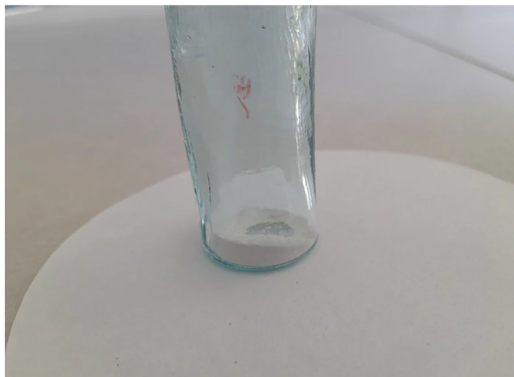
Figure 2. Zinc nanoparticles produced

nanoparticles at concentrations of 2000 and 1000 \mu\text{g/mL} had appropriate antibacterial activity, with the growth inhibition zone at a concentration of 2000 \mu\text{g/mL} in Escherichia coli and Staphylococcus aureus being approximately equal to the control sample (10). In a study of the effect of ethanolic extract of Thymus vulgaris on prostate cancer in rats, its anticancer effects were particularly evident on the proliferation of the aforementioned cell masses, and these effects were also related to the dose used. In another study, its negative and inhibitory effect on epithelial carcinoma of the head was even observed in vivo (11). In a study by Saxena et al. in 2012, they were able to produce silver nanoparticles using fig extract ( Ficus benghalensis ). These nanoparticles showed good resistance against Escherichia bacteria (12). In the study by Mittal et al., they were able to synthesize silver nanoparticles, 25 - 40 nm in size, using Rhododendron dauricum flower extract (13).