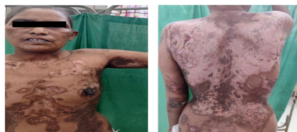
Figure 4. Areas of hyperpigmentation and cribriform scarring present over the chest and trunk (this are hypertrophic scars, cribriform we have said over buttocks so please clarify)

After 8 weeks, most of the erosions healed with hyperpigmentation, and the ulcers over the buttocks and elbow healed by cribriform scarring. A few of the erosions over the back and buttocks healed by hypertrophic scar formation (Figure 4). Complete resolution of the existing lesions with no appearance of new lesions was achieved by the end of 4 months. She is currently under regular follow-up, being maintained on gradually tapering doses of prednisolone with stringent monitoring. Even after the follow-up period of one year, the patient is still in remission.