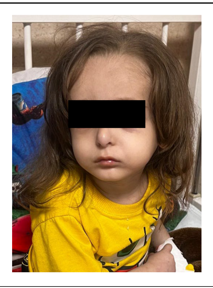
Figure 1. Hypoplasia of the alae nasi (beak-shaped nose), microcephaly, an abnormal frontal hairline pattern